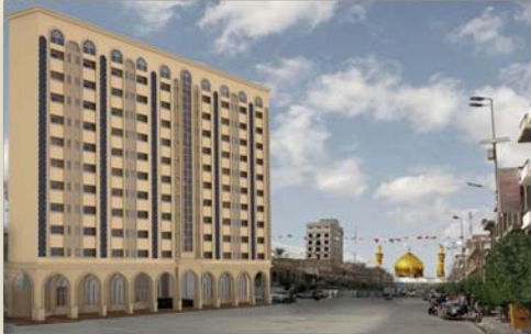
Al Qasr Residence, Karbala