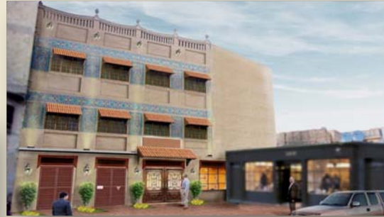
Al Najaf Residence, Najaf

Email: info@faizepanjetani.com website: www.faizepanjetani.com