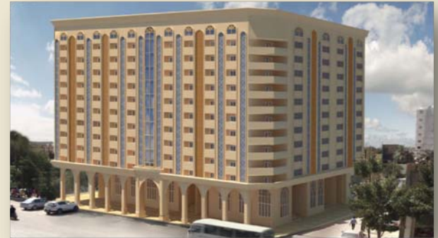
Elevated model of Al Qasr Residence - Karbala