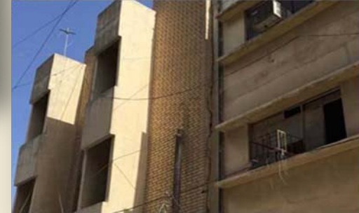
Pilgrims Residence, Kazmain